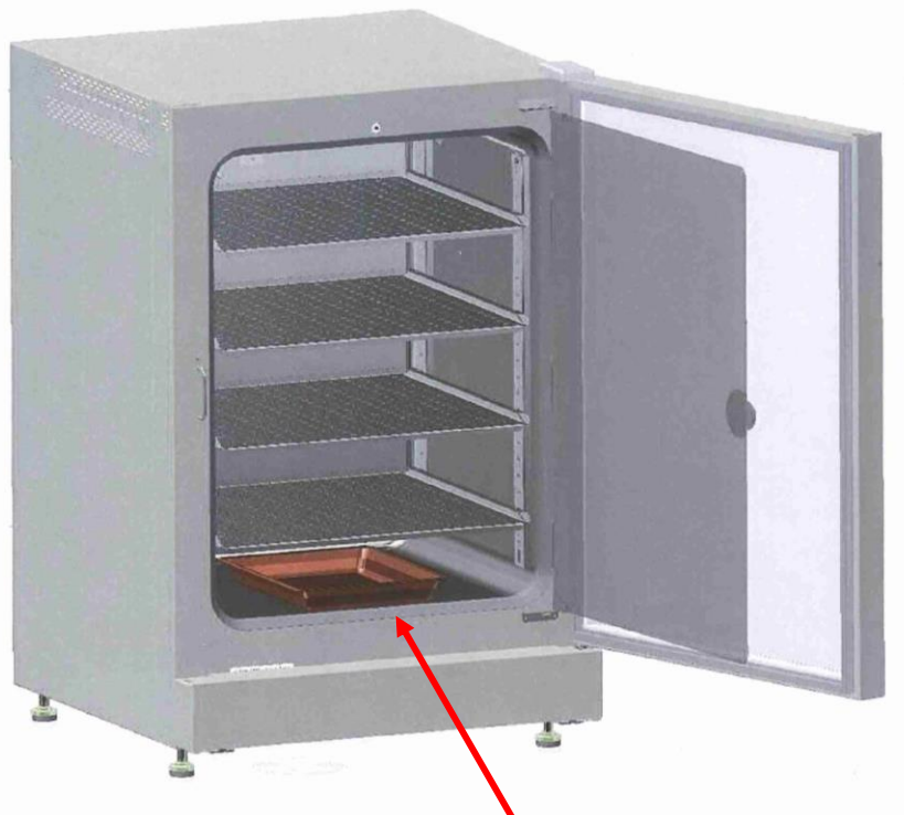
Copper Water Pan Location