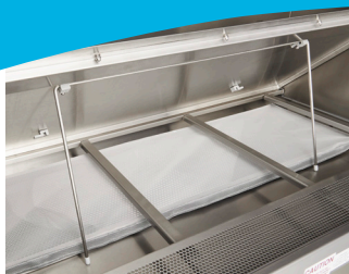
Work Tray Prop-up Bar & Fabric Mesh Pre-filter