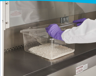
14" [356 mm] Hinged Access Opening